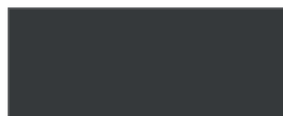
NIGHTFALL GRAY METALLIC