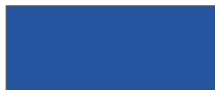
KINETIC BLUE METALLIC