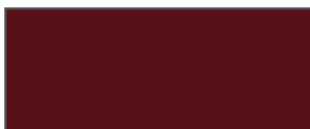
CAJUN RED TINTCOAT