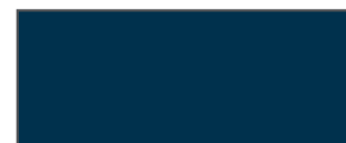
STORM BLUE METALLIC