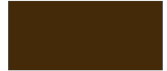
BURNT COCONUT METALLIC