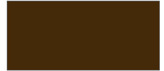
BURNT COCONUT METALLIC