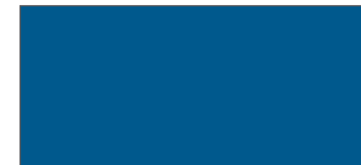
BORACAY BLUE METALLIC